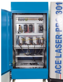
Well-organized design and careful selection of components guarantees consistent trouble-free function