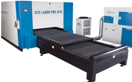
An automatic changer table system minimizes down-times by allowing simultaneous loading and unloading of the table during the cutting process