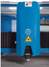
Smart cutter heads of the BLT 6 series also were custom designed for high-power laser cutting systems with max. 40 kW power