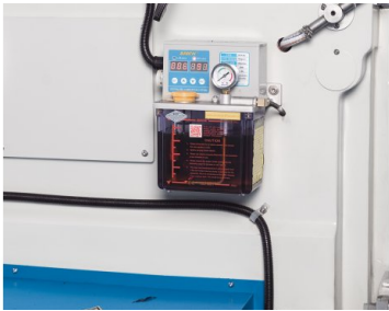
Automatic central lubrication reduces maintenance