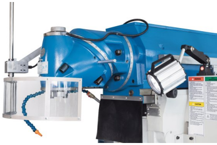
The universal cutter head can be set at any angle