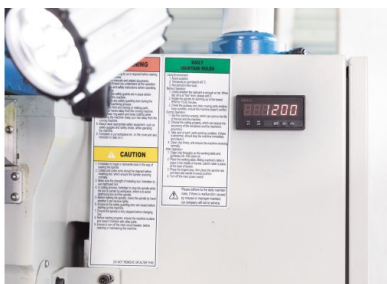
Wide speed range, infinitely variable