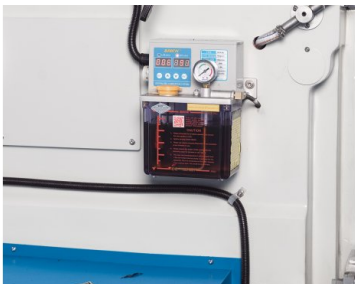
Automatic central lubrication reduces maintenance