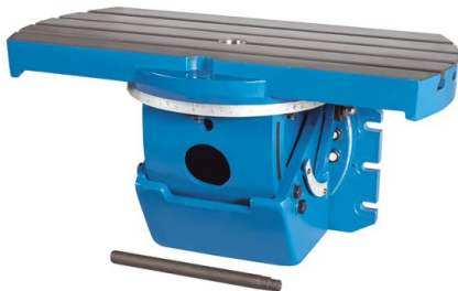
Universal swivel table for FPK 4.3/ FPK 6.3 (253721)