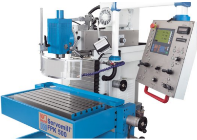
A large work table and long travels provide maximum versatility