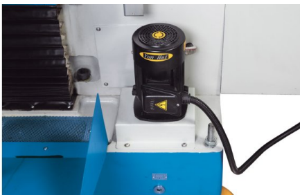
An integrated cooling system optimizes the machining process, increases tool life and improves the surface quality of your workpieces