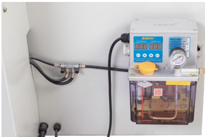
Continuous precision lubrication minimizes friction and wear of movable parts and increases the machine life