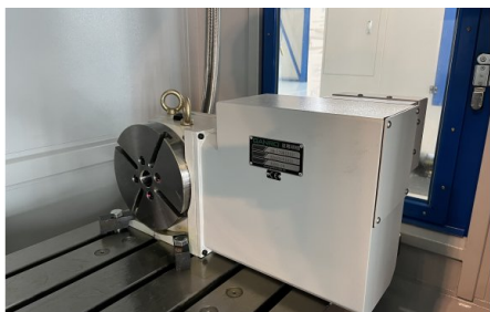
Dividing head type DR-170 with 210 mm clamping table