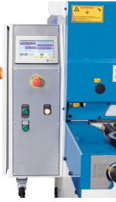
MONITOUCH HMI control panel by Fuji Electric