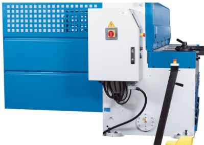
The full machine enclosure provides maximum safety, features a practical design and is precision machined