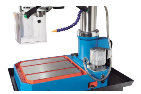
The coolant pump is integrated in the machine base