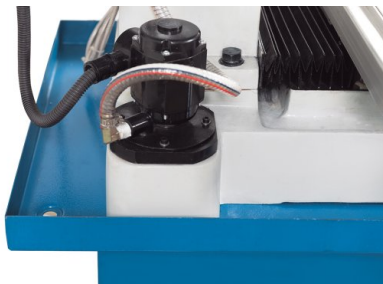
Integrated coolant system