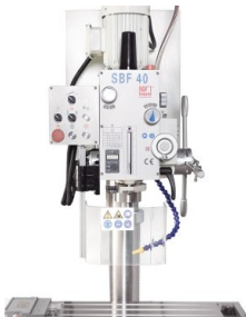
User-friendly control panel and digital depth indicator