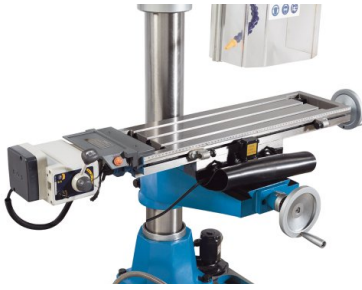
Infinitely variable automatic feed on X axis