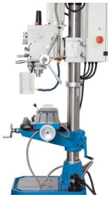
For drilling and milling