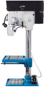
Wide throat and large work table