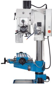
Large work area