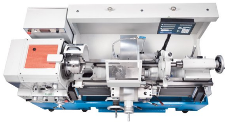
Small footprint and powerful cutting capacity; shown with optional equipment