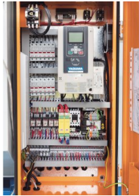
Yaskawa Inverter for infinitely variable spindle speed