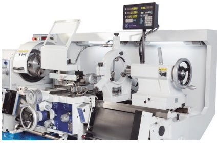
Rigid rest included with standard equipment; shown with optional equipment