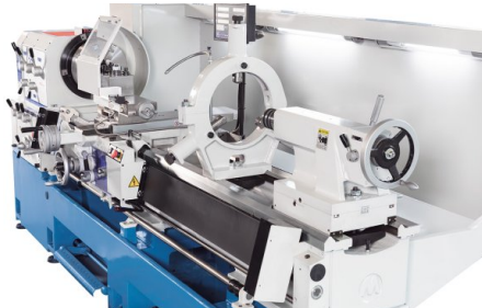
Large diameter steady rest included with standard equipment; illustration shows machine with optional equipment