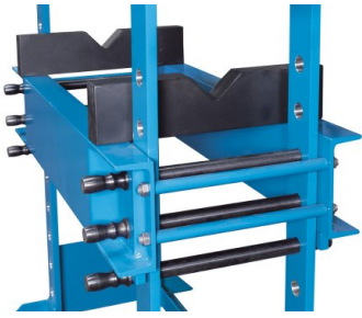
The table is fixed inside the gantry with 4 massive safety bolts